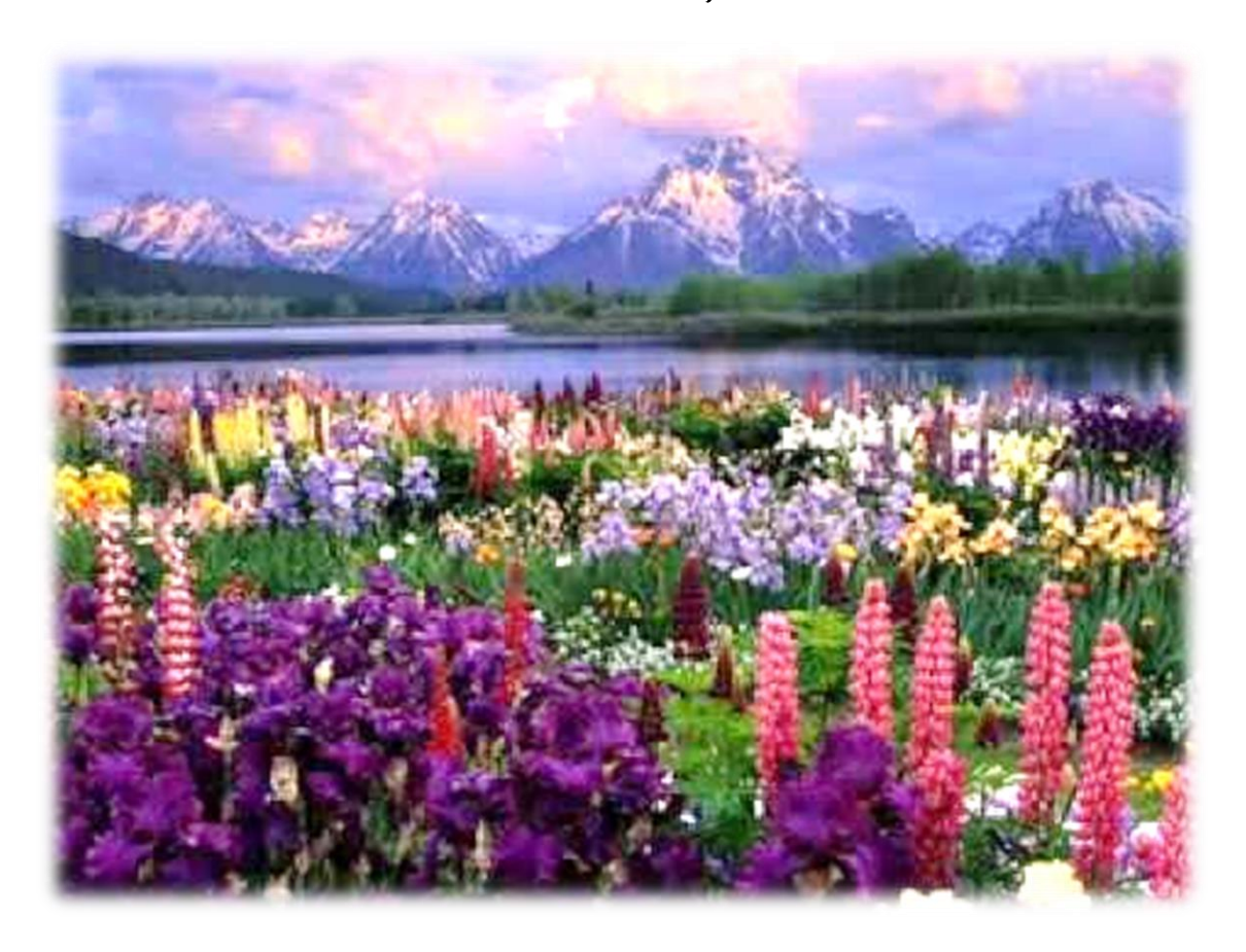
Third Sunday after Pentecost June 13, 2021

Reaching Outward to Connect People with God's Abundance