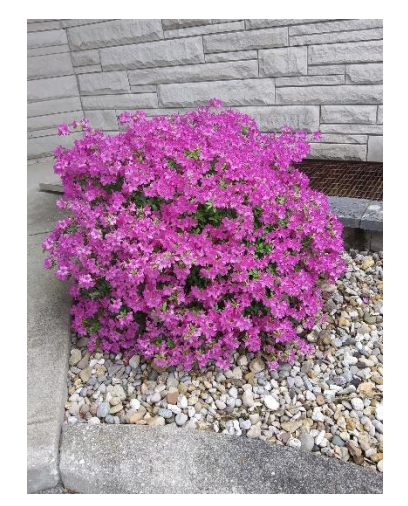
Spring Flowers Outside the Church!

The Blessing Box donations have been counted to this point. We have collected $194.26 to send to the Regional Office for missions for the various women's missions.