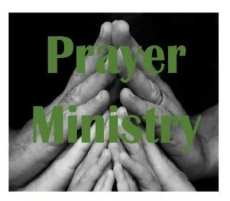
Third Wednesdays at 6:30 PM, in the Parlor First Christian Church, Bedford

Johnson Christian Village 7102 IN-158, Bedford The third Thursday of each month at 2pm.